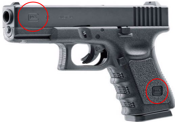
Glock G19 Luger Pistol